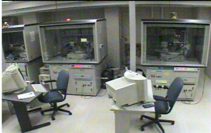
Streaming video from the lab showing both Bruker instruments

XCL Minnesota 1 Wed Apr 25 23:56:16 2007