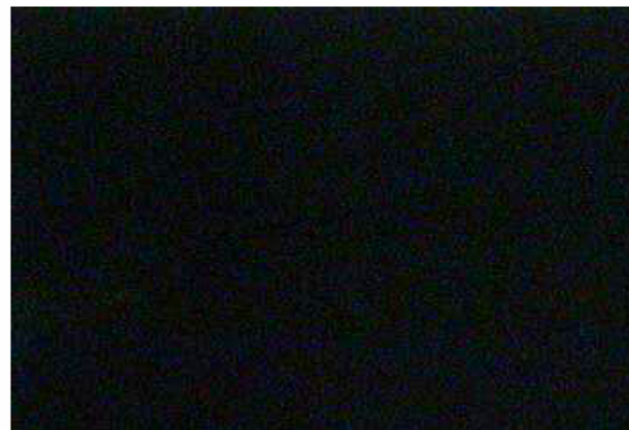
Bruker SMART 1K video-microscope view