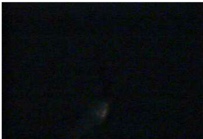
Bruker SMART 1000 video-microscope view