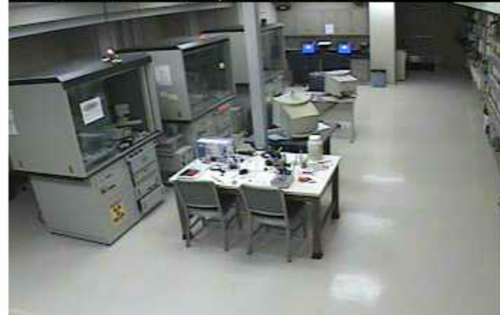
Streaming video from the XCL

XCL Minnesota 2 Wed Apr 25 23:56:19 2007